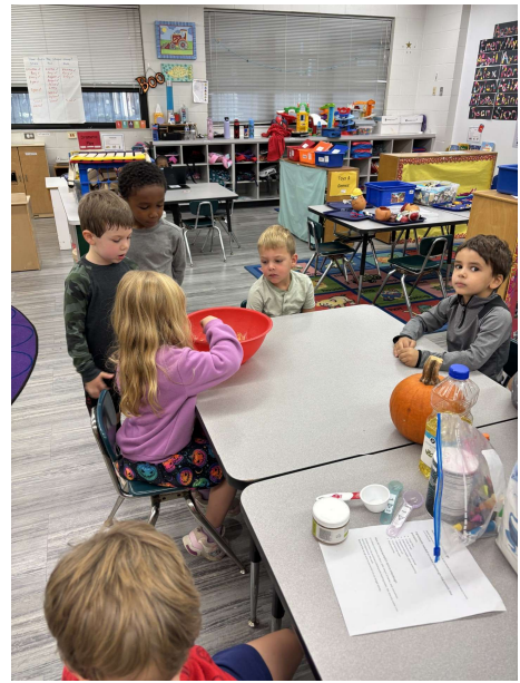
Making pumpkin playdough