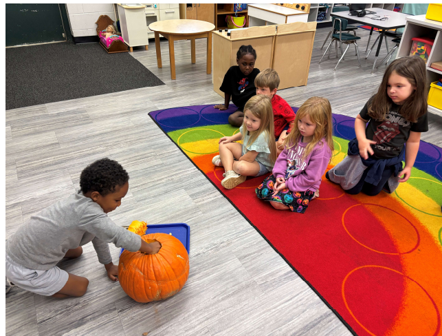
Investigating the inside of a pumpkin.